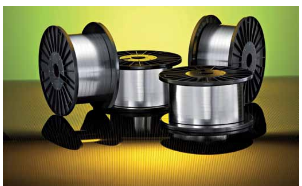
Oscillate Wound Spools