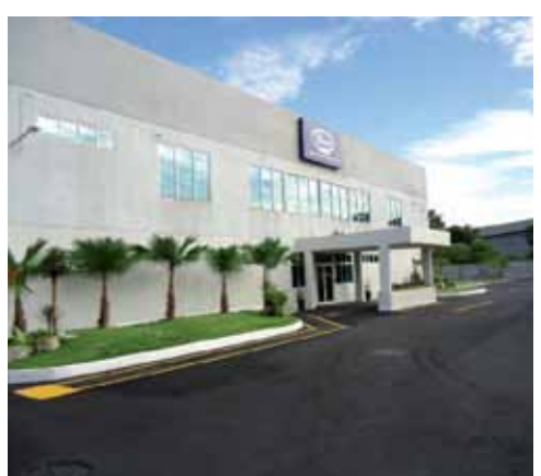
Ulbrich Asia Metals - Malaysia

and applications. When it comes to the stainless steel market, the 300 and 400 series remain our focus."