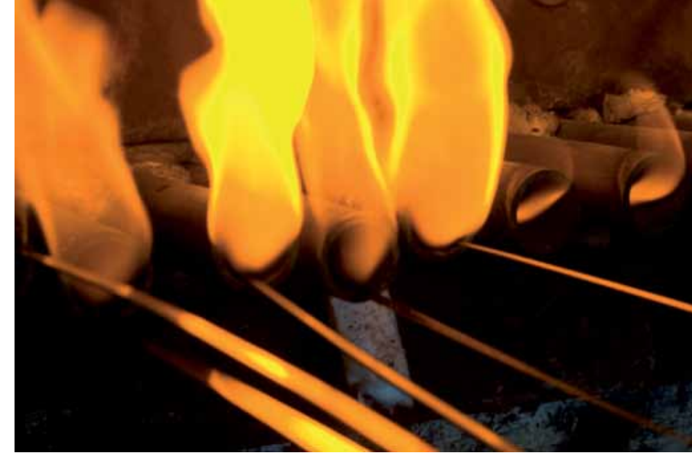
Annealing Line at Ulbrich Shaped Wire