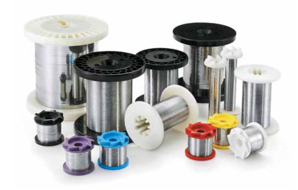
Precision Flat and Fine Wire

the company itself and its customers. She explained: "It speaks of the reliability of