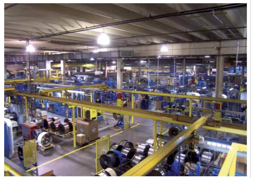
Facility in Westminster, SC

market and know all of the time, work and dedication that went into that application our products and our services. It also says is very satisfying. We always give more