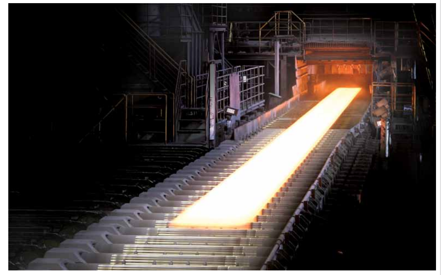
The NCH hot rolling mill, one of the very sophisticated pieces of equipment in the Kawasaki plant.

N10276 (59Ni-15Cr-16Mo-4W) for use in the