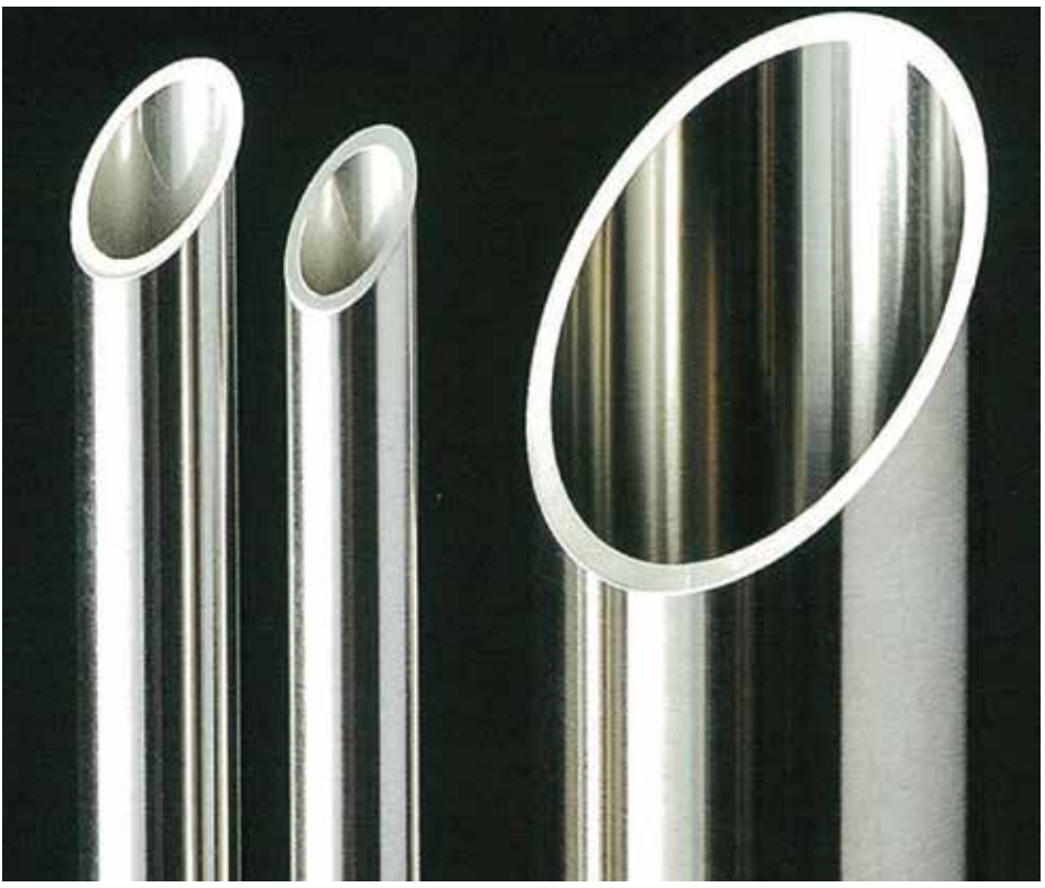
Clean pipe for semiconductor (BA tube).

Cold-finished: Materials \rightarrow Billet processing \rightarrow Hot extrusion processing by hot extrusion press \rightarrow Heat treatment \rightarrow Pickling \rightarrow Drawing/Rolling \rightarrow Degreasing \rightarrow Heat treatment \rightarrow Pickling \rightarrow Rolling straightening \rightarrow Cutting/Chamfering \rightarrow Pickling \rightarrow Test/Inspection \rightarrow Printing/Packing \rightarrow Shipment