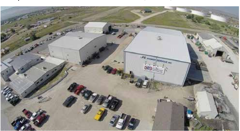
DistributionNOW's recently acquired Power Service location in Casper, Wyoming.

The first of these activities is a novel manufacturer's onboarding process, which includes a rotational physical audit of key manufacturer's sites. The second is a daily ISO 2859 based QA/QC PVF products inspection program. DNOW inspects all PVF materials received in the distribution center where materials are isolated by heat numbers and samples, then closely inspected per the ISO 2859 inspection program. Inspection includes review of Mill Test Reports (MTRs) to ensure the material meets standard specifications and traceability requirements, visual,