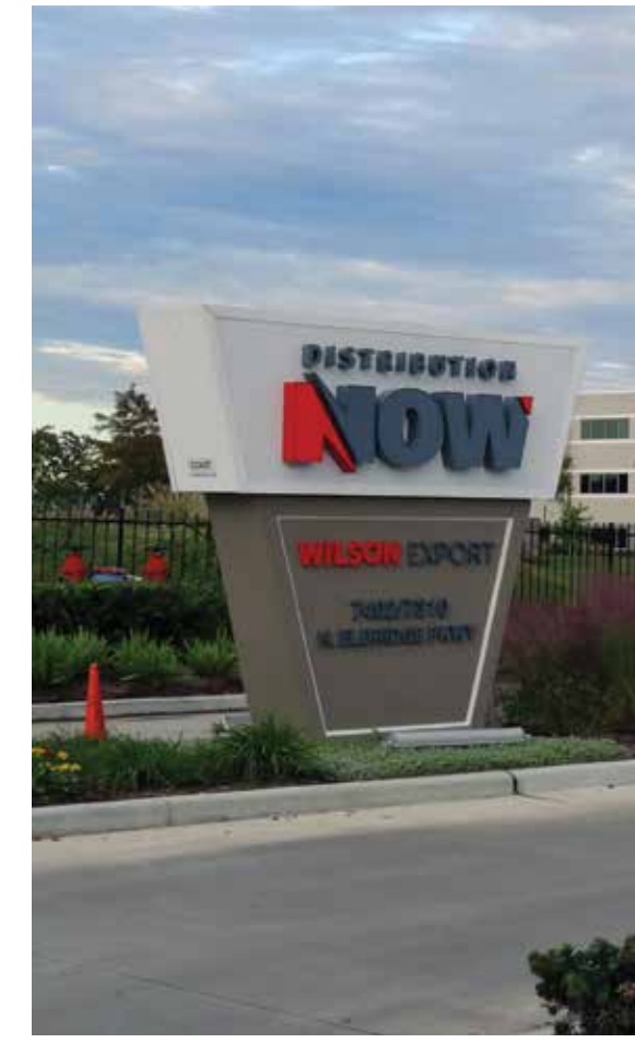
DistributionNOW's Corporate Campus in Houston, Texas.

Along with offering customers high-quality dependable products, available in a variety of materials to suit every need, DNOW also offers several different types of product service solutions. Wise explained, "DistributionNOW is historically known as a distributor of commodity and specialty products used in the oil & gas market sector. However, we are so much more than that. We are focused on providing our customers with products and solutions that allow for increased flexibil-