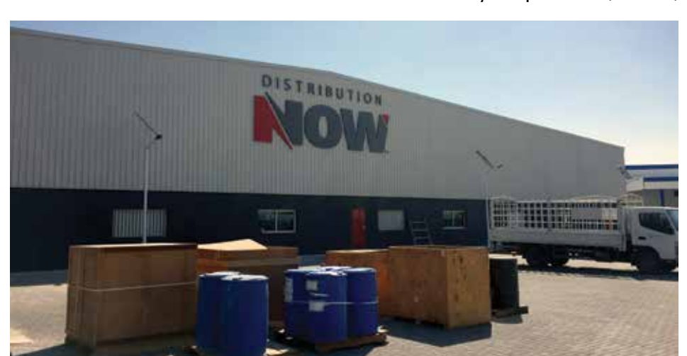
DistributionNOW's location in Jebel Ali, UAE