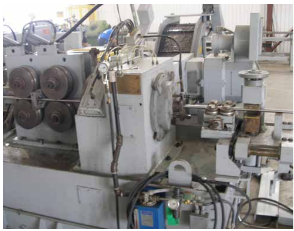
A hot rolled bar enters the Hetran bar turner, while a peeled bar exits.