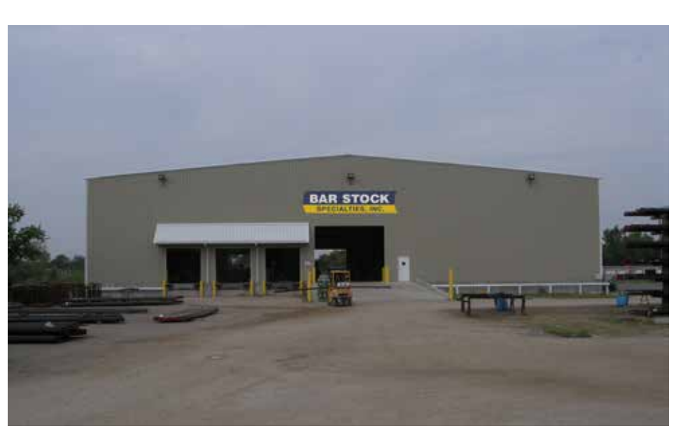
Bar Stock Specialties' stainless steel production warehouse.