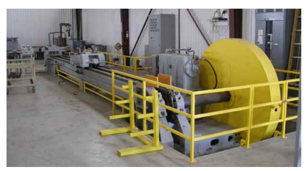
A 23-foot (7 m) draw bench for high reduction.

The straightening of long length bars, ves 0.1875 inches to 3 inches (4.8 mm to 76 mm) diameter (coil and bar) is performed on any combination of Bar Stock five straighteners. Continual checks are made to ensure the integrity and accuracy of bar straightness.