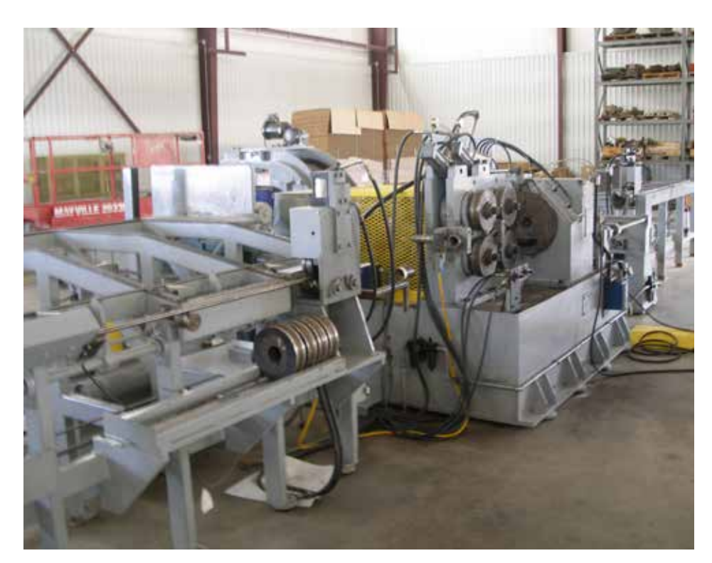
A Hetran bar turner (rotating peeler) with close-up in inset.