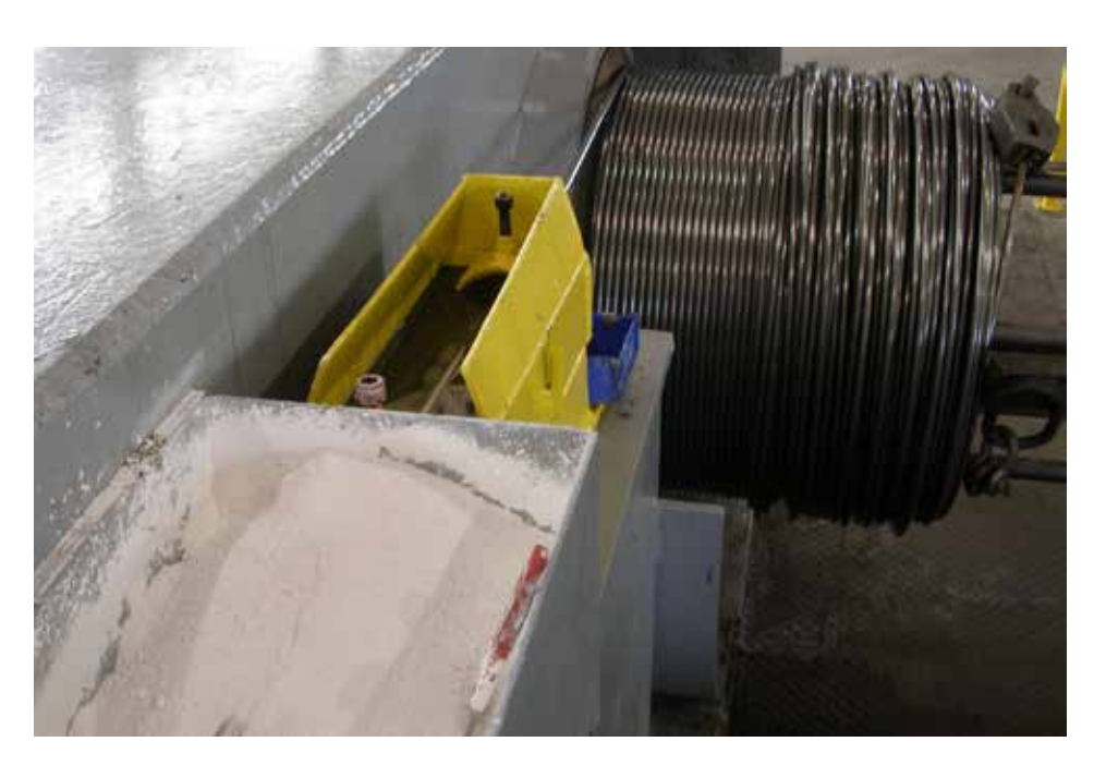
A horizontal 'bull block' cold drawing (coil-to-coil) process (close-up in inset).

Products made by these processes are subsequently either left in coil form or cut-to-length to customer specification from 3 feet up to 50 feet (0.9 to 15 m) in length. This process allows the making of custom lengths for customers who are supplying exact part multiples to the end-user saving crucial time and money. It is very common for Bar Stock to supply many sizes of steel to the down-hole oil-