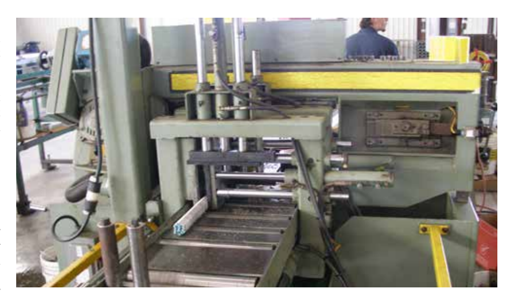
A 12-inch (300 mm) band saw.

Since its inception, Bar Stock Specialties has made it a priority to constantly find special grades of materials to add not be able to find at other distribution companies. In this effort, Bar Stock has